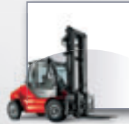
MANITOU Rough terrain and semi industrial masted trucks