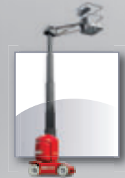
MANIACCESS Access equipment