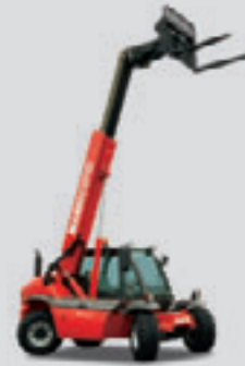
MT 620/MLT 523 T