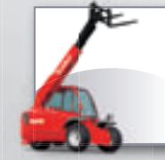
Twisco Compact telescopic handler