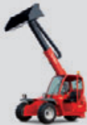
SLT 415 B EVOLUTION