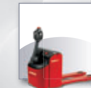
MANILEC Electric pallet trucks and electric stackers