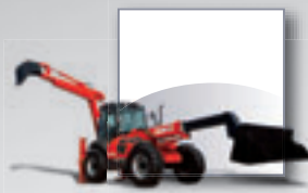
MANIHOE Backhoe/Loader with telescopic boom