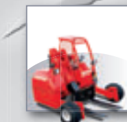
MANITRANSIT Truck mounted forklifts