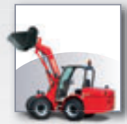
MANILOADER Articulated wheeled loaders