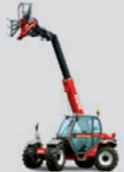
MLT 627 T 20"/24"